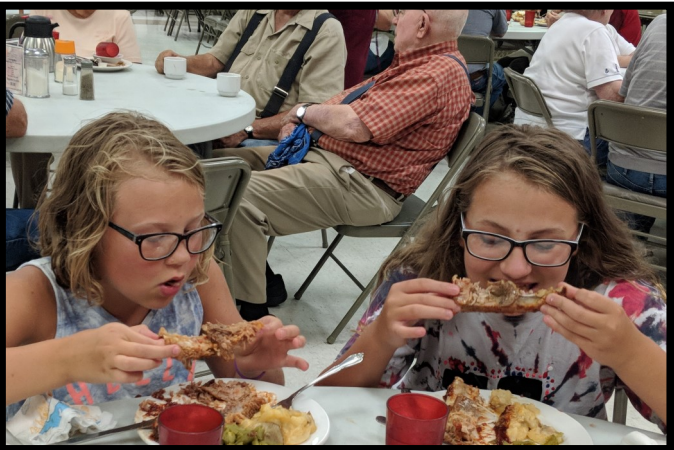
All ages can enjoy BBQ Ribs at The Center.

Indoor Display & Carving Center 1609 Broadway • Yankton, SD (605)665-3052